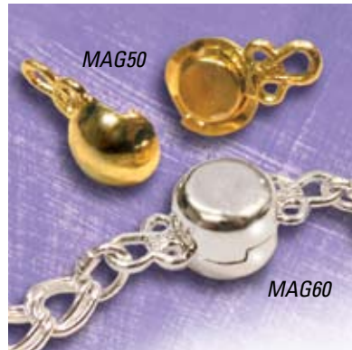
MAG50 & MAG60